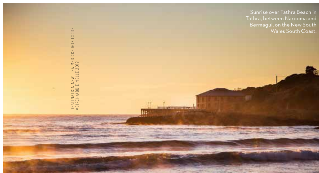
Sunrise over Tathra Beach in Tathra, between Narooma and Bermagui, on the New South Wales South Coast.