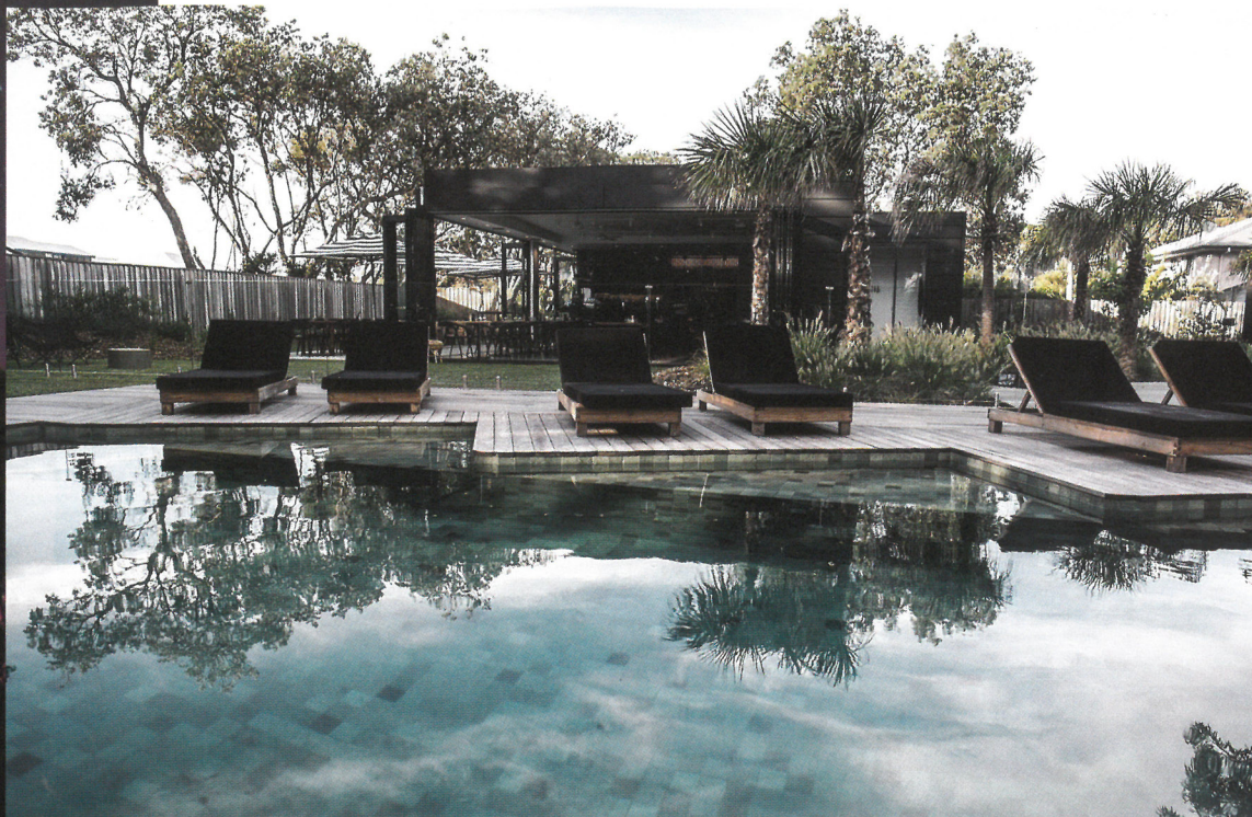
FROM TOP The pool deck at Bangalay Luxury Villas; horseriding on Seven Mile Beach; and the boutique hotel's self-contained villas and landscaped gardens.